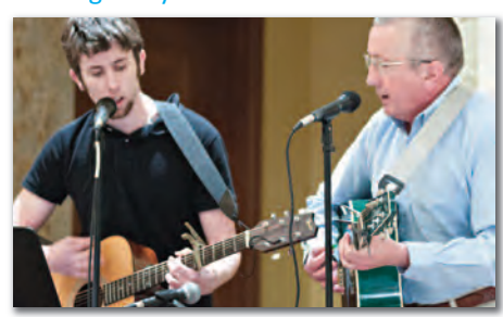
May 10 Walking In My Mother's Shoes

Attracting nearly 150 guests in its 8th season, Walking In My Mother's Shoes was a wonderful mixture of culture, featuring an art exhibit, singing, poetry and storytelling. It is organized