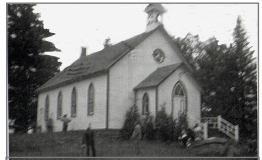
Newer Methodist Church