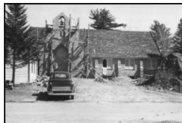
Under construction, 1950's