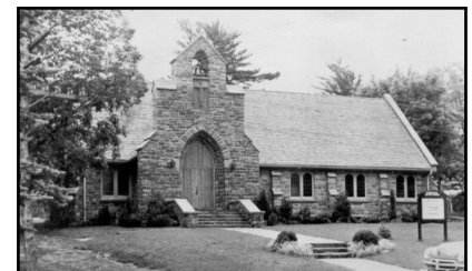
Completed Stone Church

Windermere United Church is open Fridays 9:30-12 in July and August for unplugging / praying / or chatting, and weather permitting they will have the labyrinth up, a wonderful space for contemplation, meditation and prayer. They also collect clothing donations for the Kidney Foundation.