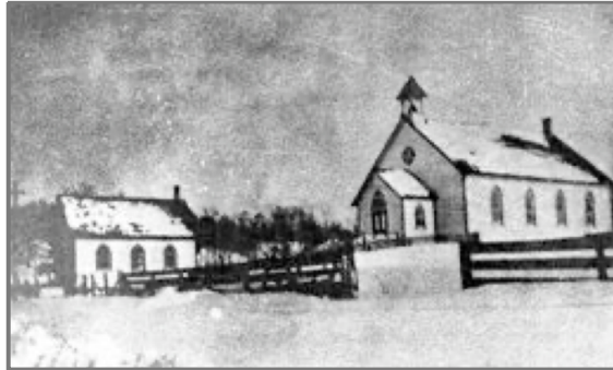
Original church of 1887 (left), Newer church of 1894 (right)