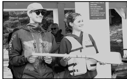
Windermere Great Canoe Race, 2024