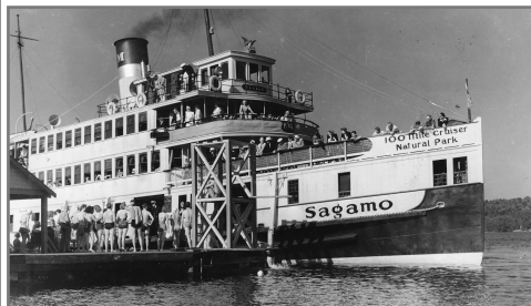
The Sagamo at Wigwassan Dock, 1950's