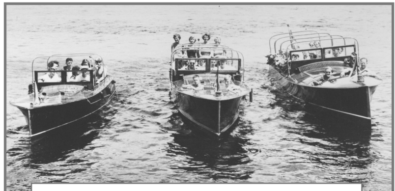
Wigwassan 5, Wigwassan 3 & Wigwassan 4, 1950's

These vessels were the lifeline to the mainland, the sturdy link to Windermere, ensuring the smooth transit of guests and the delivery of supplies. They were the chariots that carried the rhythm of life at the lodge, from the mundane to the extraordinary. The launchmen, a crew of four, were the unsung heroes of this aquatic ballet. Living in the boathouse beneath the dance hall, they formed a hierarchy that ranged from the head launchman to the boat boy, each with their own set of responsibilities and adventures. Turnbull's journey began as the boat boy in 1960, tasked with the grunt work of renting canoes, running the freight boat, and sweeping the dance floor after the nightly revelries. With time, he ascended to the role of head launchman, overseeing the operations that kept the lodge's heart beating. The working fleet comprised five vessels, each with its unique character. The freight 'boat' was a modest pontoon craft, powered by a temperamental Buccaneer 25 hp outboard engine, used for hauling everything from gravel to beer. But the crown jewels of the fleet were Wigwassan III and IV, or Wiggy III and IV as they were affectionately known. These 'hotel boats' were the workhorses of the lodge, ferrying up to 19 and 24 passengers, respectively. Complementing them were two Peterborough cedar strip outboards, powered by reliable Johnson and Evinrude engines.