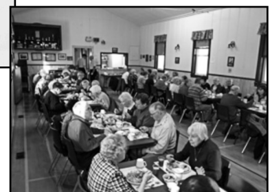
Community support and camaraderie.